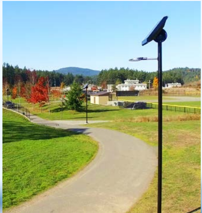
Increase visibility in parks