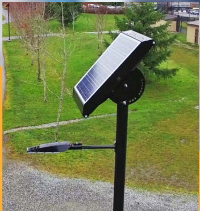
Safer learning environments