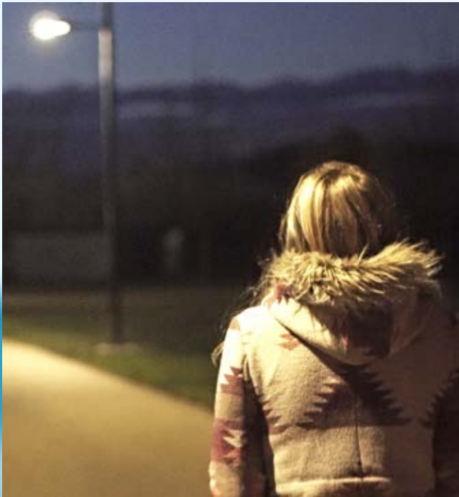
Ideal for pathway lighting

RMS systems offer an eco-friendly lighting solution in a compact, easy to install package ideal for parks, trails, pathways, sign lighting projects and more.