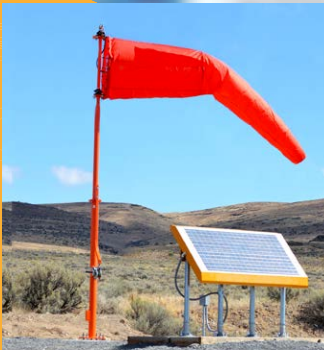
Remote power and sign lighting